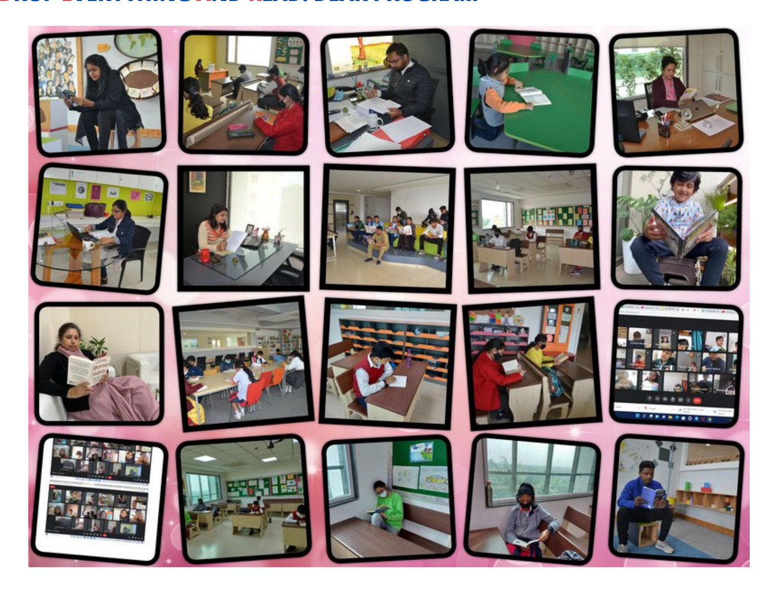
"There are many little ways to enlarge your child's world. The love of books is the best of all"-quoting the words of Jacqueline Kennedy

One of the best ways to enhance vocabulary and improve brain connectivity is to read. As it is rightly said, the more we read, the more words we gain exposure to, and they'll inevitably make their way into our everyday vocabulary. In our internet-crazed world, attention is drawn in a million different directions at once as we multi-task every day. When we read a book, all of our attention is focused on the story—the rest of the world just falls away and we can immerse ourselves in every fine detail we're absorbing. Exposure to published, well-written work has a noted effect on one's writing, as observing the cadence, fluidity, and writing styles of other authors will invariably influence our work. In addition to the relaxation that accompanies reading a good book, it's possible that the subject we read about can bring about immense inner peace and tranquility. With an intent to inculcate the reading habit, GD Goenka Public School, Indore is taking this privilege to inform you that we have begun with the reading campaign to widen the horizon of the young minds, D.E.A.R. Every Wednesday, from 10:40 a.m. -10:55 a.m. every member of the GD family would: