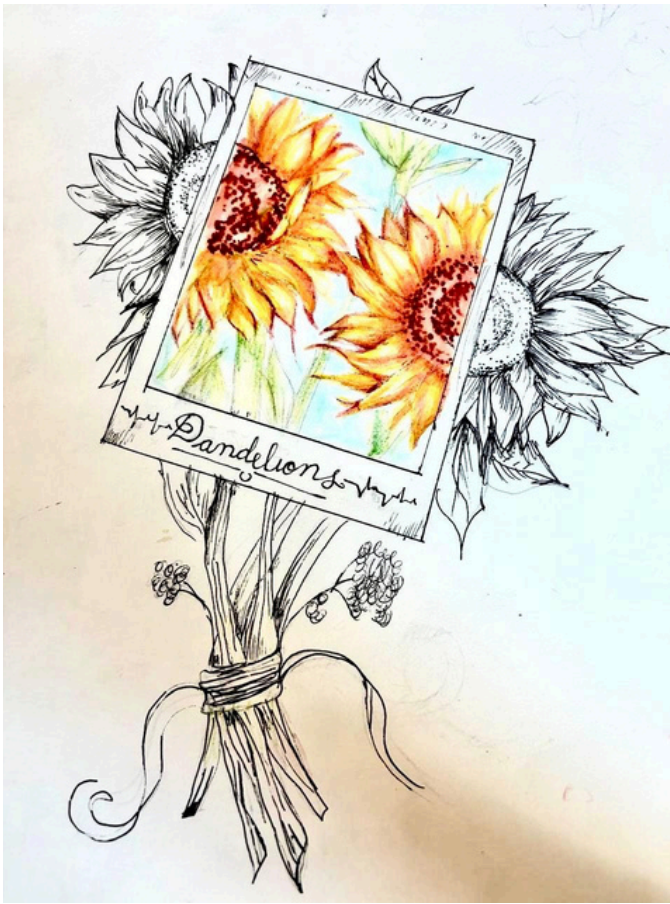
NIYATI CHAUHAN - V