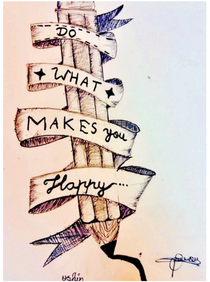
OSHIN PANWAR - V