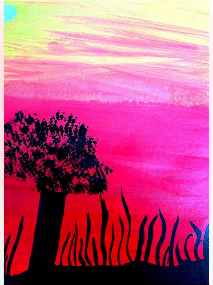
Ayaan Parbatani III